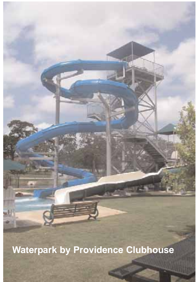
Waterpark by Providence Clubhouse