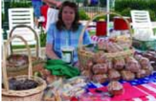
Memorial Day Event on May 27th. See page 7 for details!

Providence HOA 809 Oakcrest Drive Providence Village, TX 76227