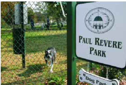
Paul Revere Dog Park in the Creek Village, across from the Ballpark.

For that four-legged member of your family, don't forget to take advantage of the dog park, Paul Revere Park, located in the Creek Village. The dog park is right next to the Ballpark, and your dogs can run and play inside a chain link fence without a leash, and even make new friends with other four-legged neighbors. Besides, dogs need exercise too!