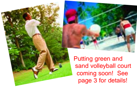
Putting green and sand volleyball court coming soon! See page 3 for details!