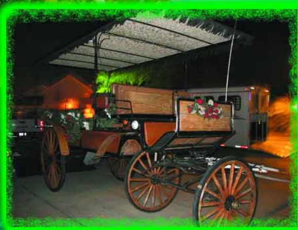
Carriage rides provided by Three Jay Carriages

Treelighting ceremony caroling led by The Living Christmas Card.