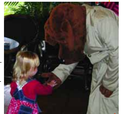
Safety Kids Club. See page 8 for more details!

Sports Committee organizes fun, interesting sports activities for the entire community so neighbors can meet and socialize with each other for friendly competition. Email sports@providencehoa.com